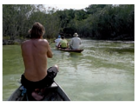
Canoeing, the only transport at the reserve