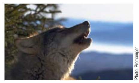
Viable packs of wolves roam these forests

Two years ago a group of dedicated conservationists and philanthropists got together to face this daunting challenge and to develop a conservation strategy based on the creation of a large European wilderness reserve of at least 50,000 hectares. We first needed to identify a large contiguous area of pristine wilderness – but as you might imagine, this is a difficult task anywhere in