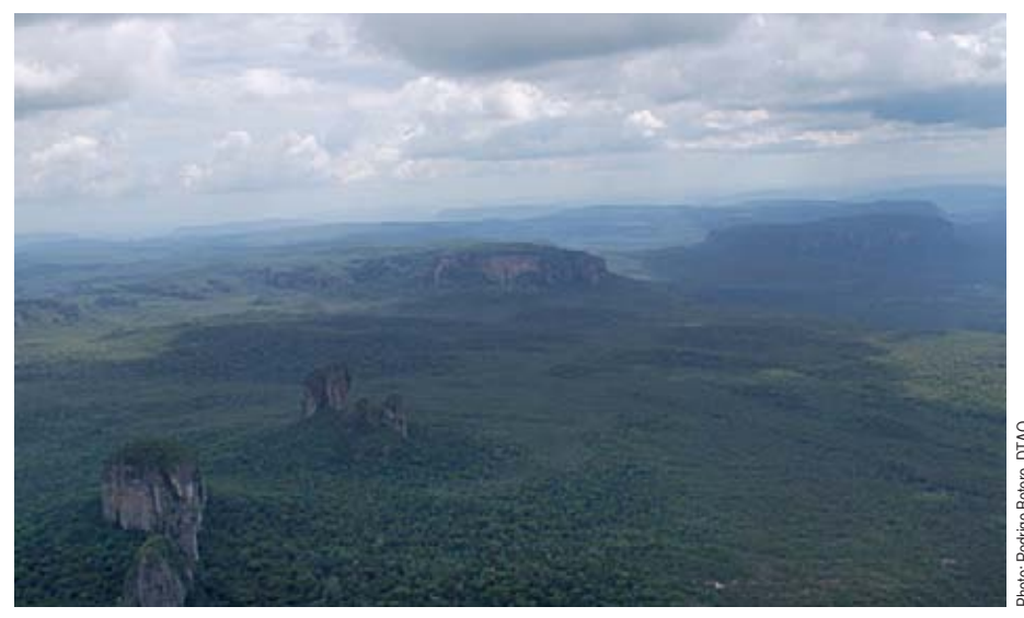
Stunning panorama of Serranía de Chiribiquete - proposed area for the project's expansion

The Caquetá River basin occupies 44% of the Colombian Amazon (21 million hectares) and, with the neighbouring Putumayo and Negro River basins, they form the country's entire Amazon region.