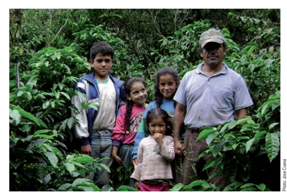
Agroforestry. Coffee planted by the Media Villa family