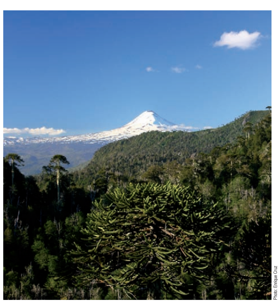
Viewpoint towards the Llaima Volcano and Monkey Puzzle forests from Nasampulli Reserve