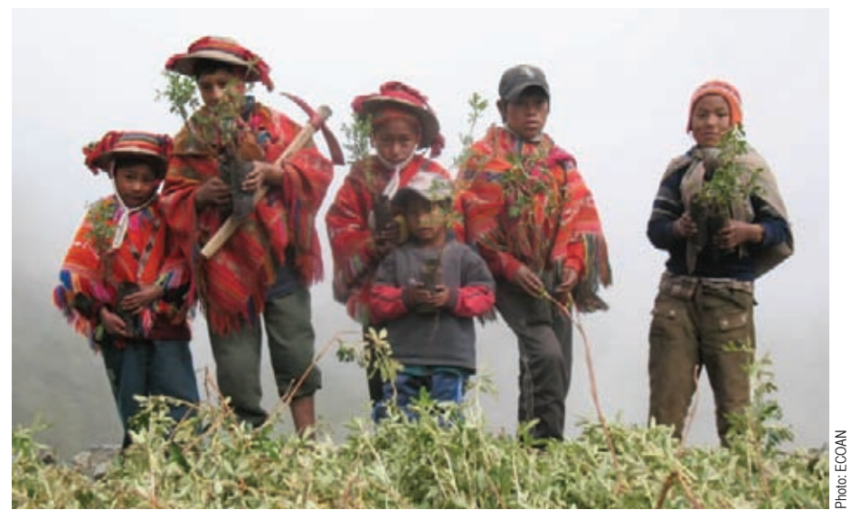
Reforestation with Polylepis seedlings. Community of Rumira Sondormayo

ECOAN organised expeditions over the Andes near Marcapata in the cloud forest region on the Eastern side of the Andes going towards the Amazon, where the Trans-Oceanic Highway is being built connecting Brazil with Peru. The road is known as the Trans-Amazonica in Brazil. This is a huge World Bank funded project and while it