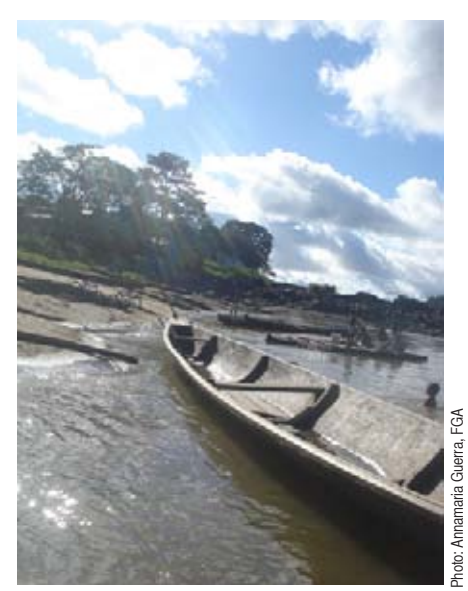
La Pedrera on the Rio Caquetá

Since 2007 Rainforest Concern has partnered with Fundación Gaia Amazonas, to promote the shared socio-environmental management of the Caquetá River basin in the Colombian Amazon, and baseline research in this region has made it possible to identify main threats to the Colombian Amazon in general. In particular, Rainforest Concern supports the expansion of protected areas and indigenous resguardos over 5 million hectares and the building of local capacity of the indigenous people to manage these territories based on their traditional knowledge and practices.