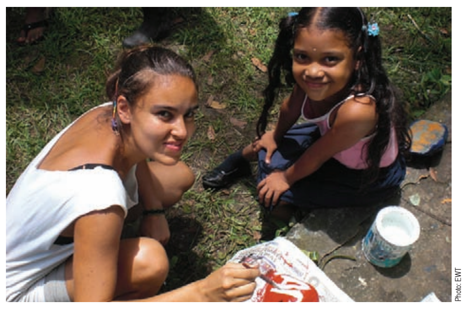
A volunteer interacting with local children