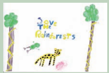
Gendros Primary School 2010