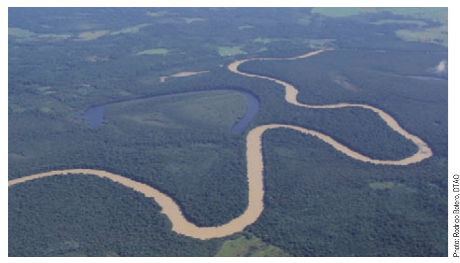
View showing the advance of colonisation in the Caqueta basin

The idea to create a national park was, to a large degree, a last resort. Faced with increasing pressure from Cosigo Resources and other companies to access the minerals and petroleum found in the Colombian Amazon, and a flood of permissions being handed out by the Ministry for Mines, the traditional indigenous authorities (elders and traditional knowledge holders) saw it