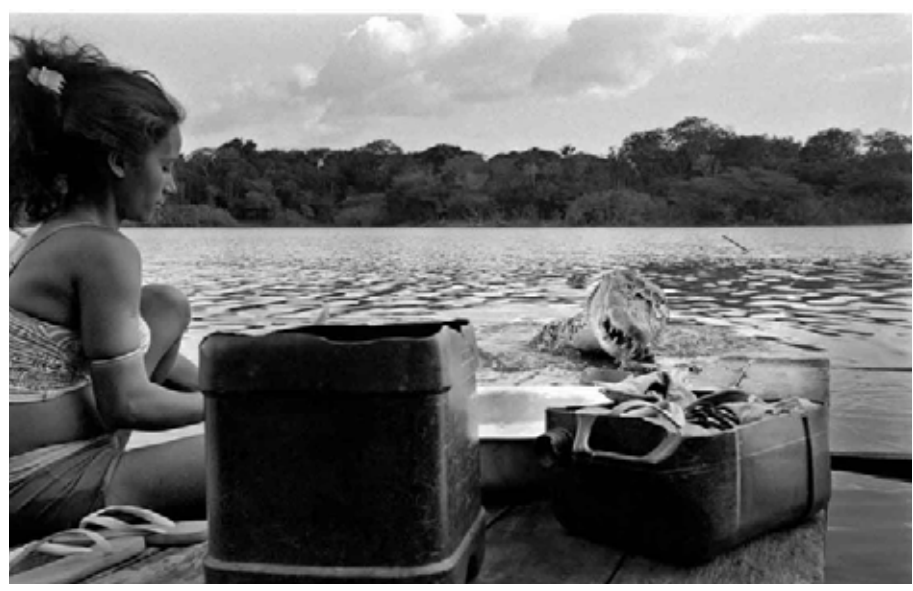
Caimans living in the reserve's lagoon are accepted as part of the scenery!

Now begins a new challenge for the Amazon Association, which is to provide services and a standard of living comparable to that in the Xixuau to a further 800 traditional inhabitants in another 8 villages in the new reserve. The model has proven to work in the Xixuau and it needs to be expanded to the entire 630,000 hectares of the Extractive Reserve.