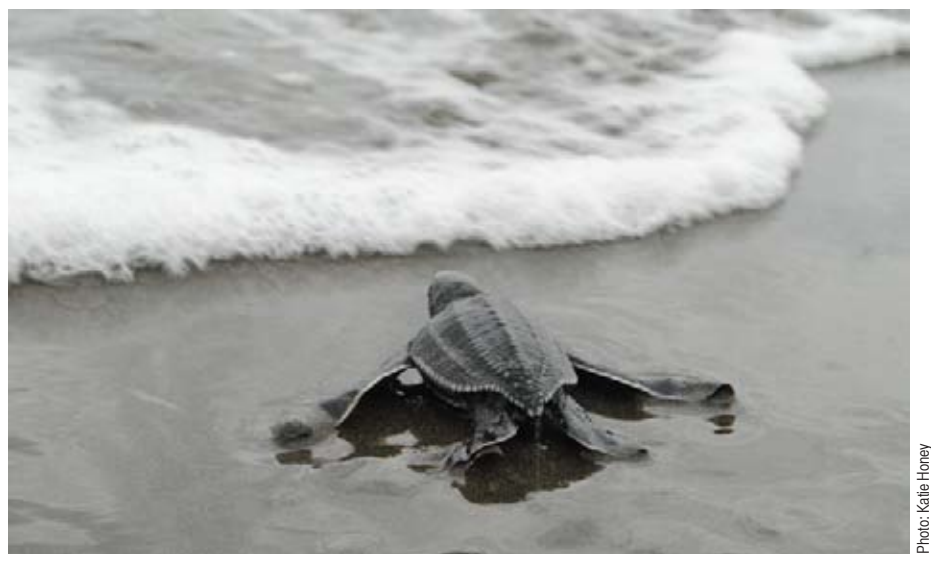
A Leatherback hatchling's mad dash for the open sea

Sixaola beach is isolated and inaccessible and a reliable man, Huascar, has been trained to work with turtles. He has now recruited and trained 6 men from local communities to work on the beach during the season and they are paid for