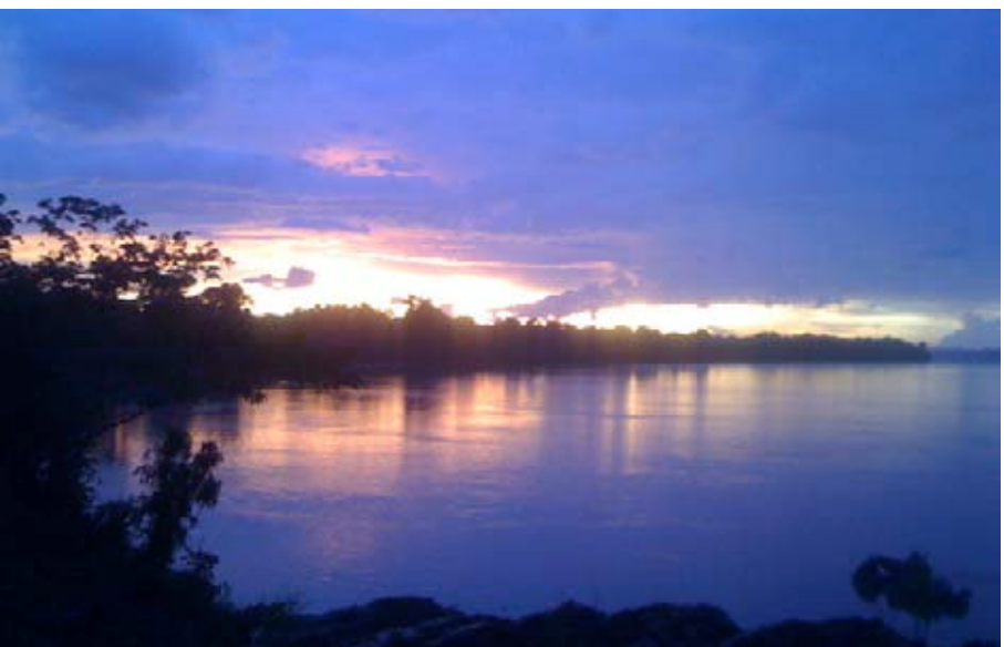
An evening on the Caqueta river

We wish to specifically thank Rainforest Concern and the Planet Foundation for their continued enthusiasm and support in assisting Gaia Amazonas to protect this huge and pristine region of the Colombian Amazon.