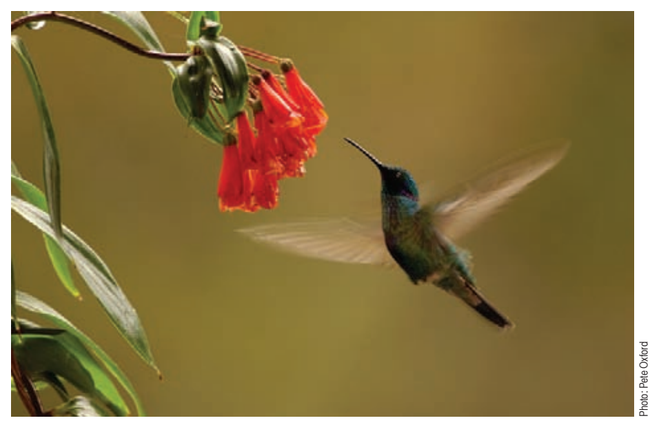
Sparkling Violetear hummingbird

What makes this so incredulous is the way the government appears to be violating its own Constitution, in particular the rights of local government to plan the use of its land.