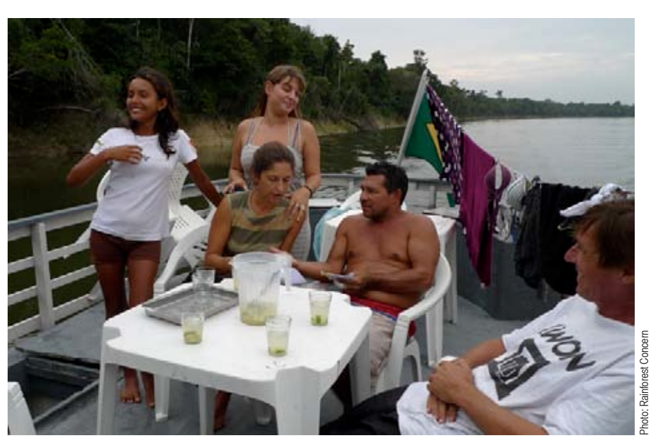
Enjoying a caiparinha on the long journey from Manaus to the Xixuau Reserve

Opposition from local politicians to the creation of the Extractive Reserve led to a large number of delays and problems, but at the same time brought in other actors like the WWF with the ARPA (Amazon Region Protected Areas) project. The reserve is inside the planned mosaic of conservation units, which forms the Central Amazon Ecological Corridor that is financed by the World Bank and is part of the G7 Pilot Project for the Protection of the Amazon. The association was also joined by the Social Environment Institute, the Vitoria Amazonica Foundation, The Amazon Working Group and a number of other Brazilian government and civil society institutions.