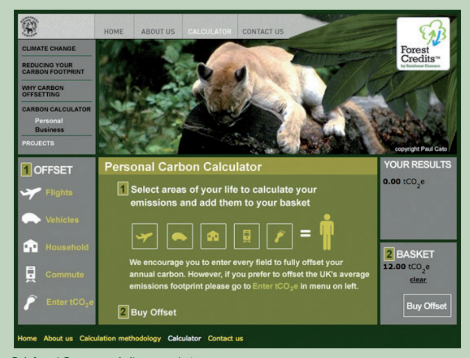
Rainforest Concern website a snapshot

The first of Rainforest Concern's dedicated carbon forestry projects is part of the Neblina Reserve in Ecuador, an area of over 1,300 hectares situated in the Choco-Andean corridor North of Quito, which safeguards exceptionally high biodiversity and an important watershed for local communities. Rainforest Concern's first step was to purchase the land which was under pressure from deforestation for mining and conversion to pasture, commercial agriculture and timber exploitation. Now and going forward, carbon