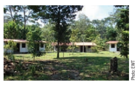
The newly rebuilt and greatly improved South Station

With thanks to Halcrow for their assistance.