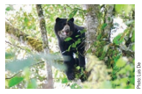
Spectacled bears will be a victim of mining