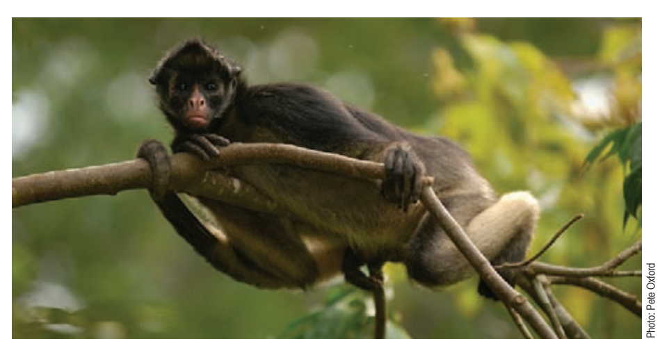
A spider monkey

Gaia Amazonas accompanied the requests for expanding the territory covered by Mirití Paraná and Nonuya de Villazul resguardos, and supported the required studies and documentation. The requests for increasing the coverage of these resguardos were handed to INCODER (Colombian Institute for Rural Development), the government entity responsible for establishing or expanding indigenous resguardos. In December 2009 the Board of Directors of INCODER approved the expansion of these indigenous resguardos by 420,000 hectares. This decision was recently officialised and will be published soon in the Official Journal.